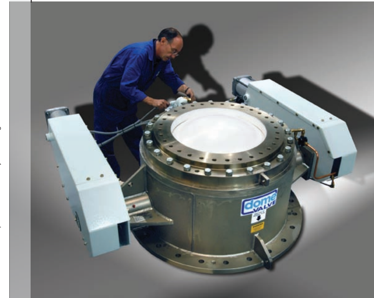
A fixed scope of work including labour and parts from Schenck Process Aftermarket Service to improve process efficiencies

01/14. All information is given without obligation. All specifications are subject to change.