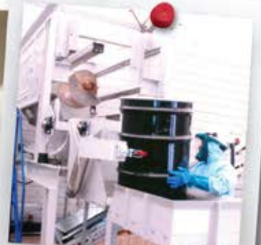
Drum emptying station