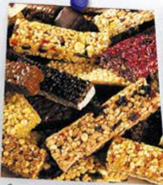
Continuous mixer for cereal & confectionery bars