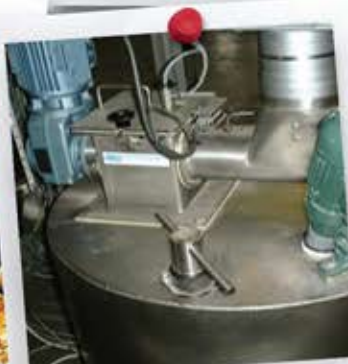
Cantilever dosing screw feeder

PHARMACEUTICAL FOOD CONFECTIONERY CHEMICAL ENERGY