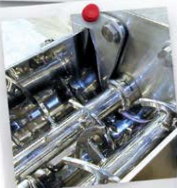
Pharmaceutical continuous mixer