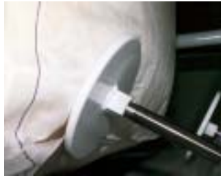
Air operated bag jostlers provide variable bag agitation.

Optional air actuated bag jostlers can be provided to agitate and dislodge material from the bulk bag. They are programmed to operate in a sequence which best suits the particular application for maximum performance.