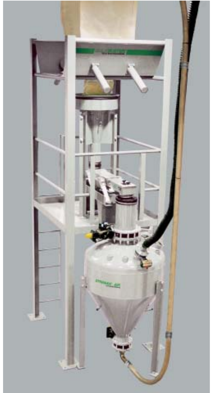
BulkBuster Bag Unloader with bag jostlers, inflatable cuff, bag splitter, vibratory feeder and pneumatic transporter.

Dynamic Air will provide a comprehensive bulk bag unloading system to get your material out of the bag and into your process. Complete systems can include feeding, weighing, batching, blending, mixing, conveying, storage and master control equipment. We offer complete engineering and design and a full scale test facility.