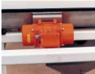
Vibrating hopper enhances gravity feeding of coarse materials.

For very coarse granular materials, a vibrating hopper can be provided with any BulkBuster bulk bag unloader. The vibration enhances gravity feeding for fast and complete material discharge.