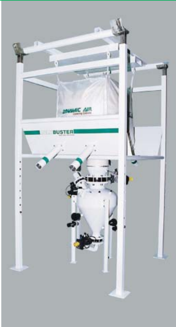
BulkBuster™ Bag Unloader with bag jostlers, inflatable cuff and pneumatic transporter.