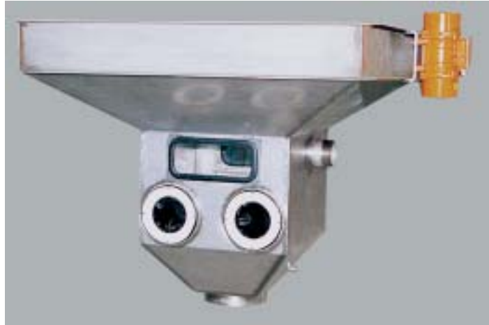
Shown above is a vibrating hopper with viewport and glovebox.

For very coarse granular materials, a vibrating hopper can be provided with any BulkBuster bulk bag unloader. The vibration enhances gravity feeding for fast and complete material discharge.