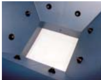
Vibra-Jet bin aerators enhance flow of fine granular materials.

For very fine granular powders that tend to bridge or hang up, Vibra-Jet® bin aerators can be provided to promote free flow of the material.