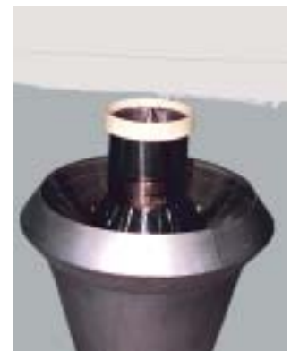
Shown above is a bulk bag slitter without inflatable cuff and the slitter blade in the retracted position.

An air operated bulk bag slitter can be provided for bulk bags which must be pierced to open. The slitter blade is forced upward to pierce the bulk bag and allow material to discharge. The slitter also has a dust pickup collar to contain any dust during discharging and can include an inflatable cuff to assure a positive seal for bags that have an outer spout.