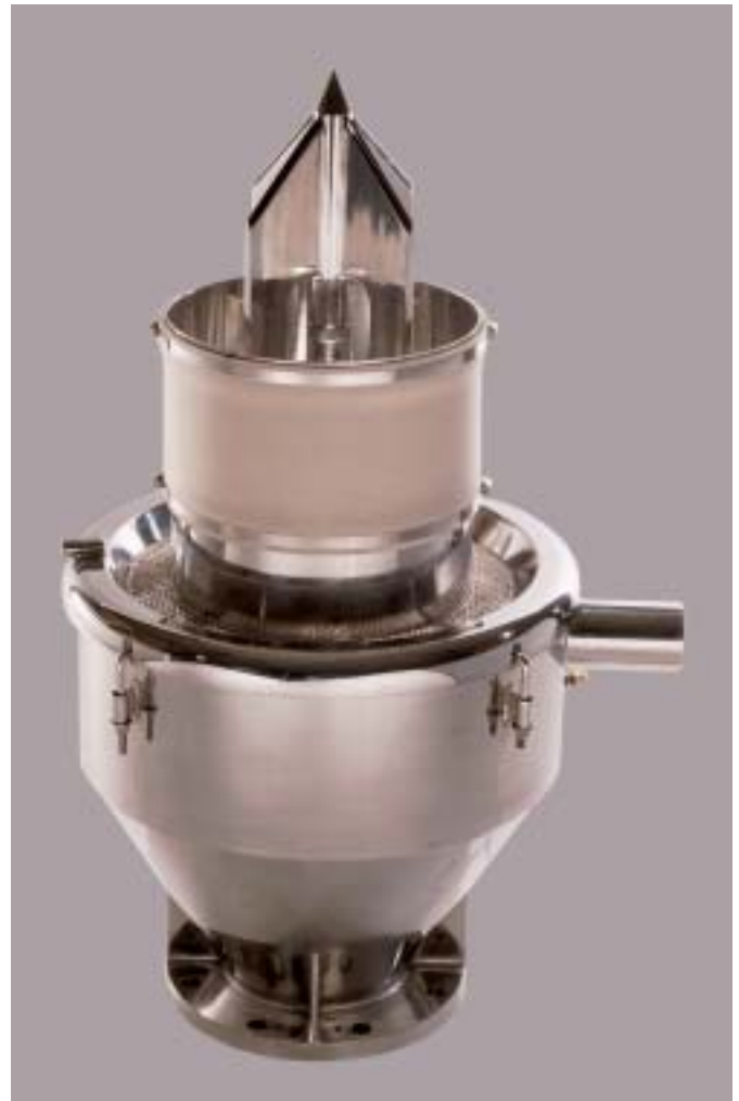
Shown above is a polished 316 stainless steel inflatable cuff style bulk bag slitter with the slitter blade in the upward position.

An air operated bulk bag slitter can be provided for bulk bags which must be pierced to open. The slitter blade is forced upward to pierce the bulk bag and allow material to discharge. The slitter also has a dust pickup collar to contain any dust during discharging and can include an inflatable cuff to assure a positive seal for bags that have an outer spout.